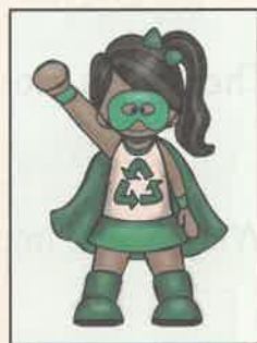
No one knows the true identity of Recycle Lass.

By the end of the day, pupils had gathered up every old cardboard box and piece of scrap paper, and the recycling bins were full to the brim.