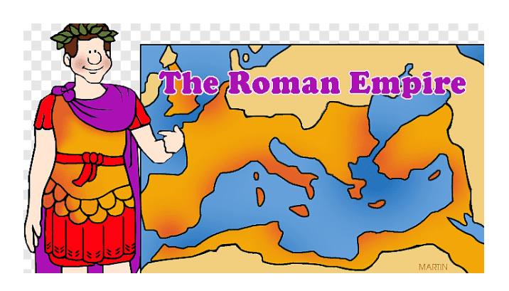
The Roman Empire began

Your task is to put the facts from the video in order!