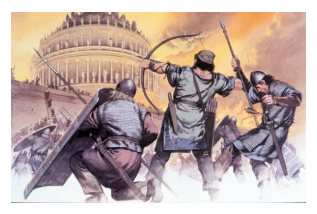
The Roman Empire ended because Germany invaded Rome