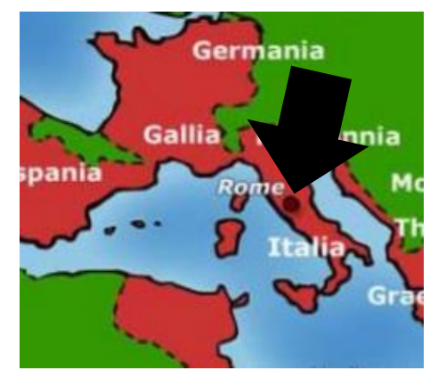
Rome was founded (2,800 years ago)